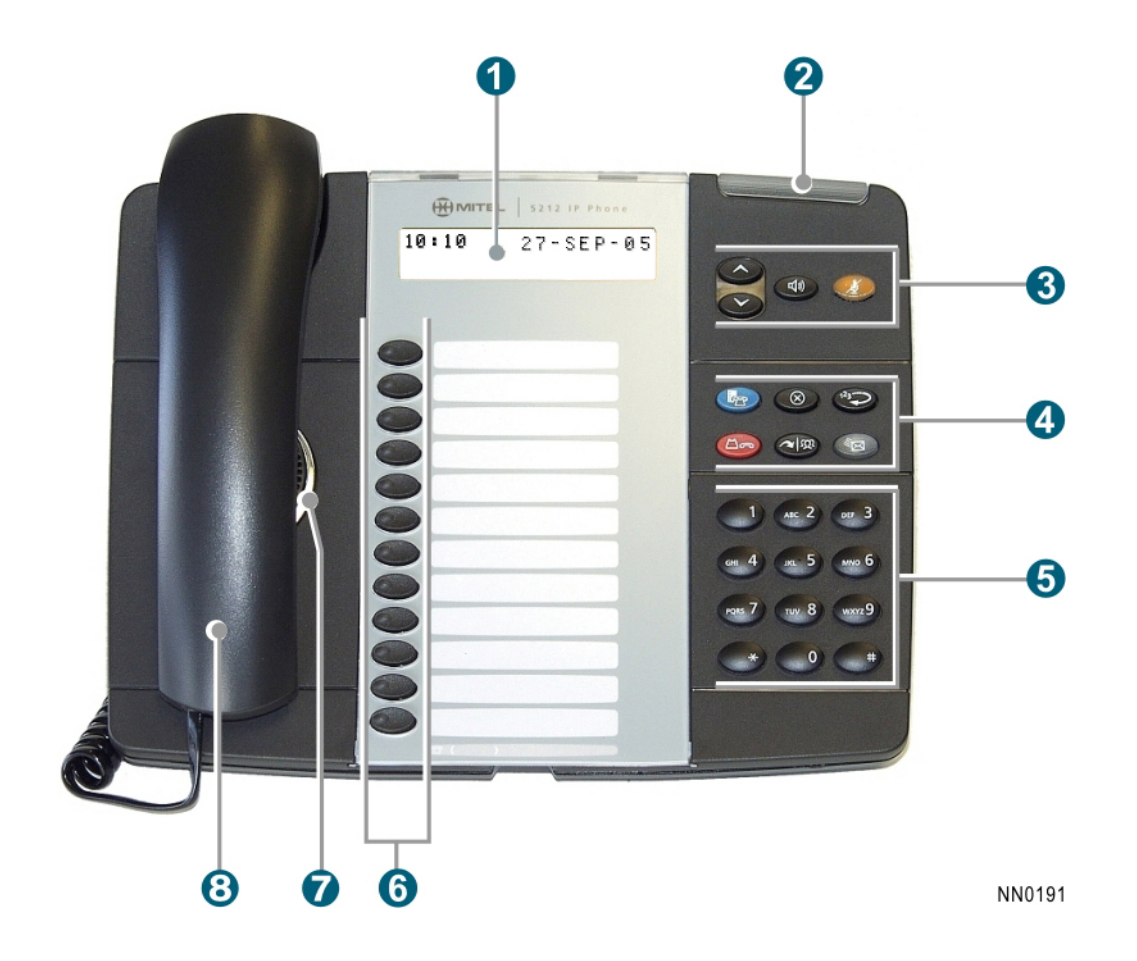
The 5212 IP Phone